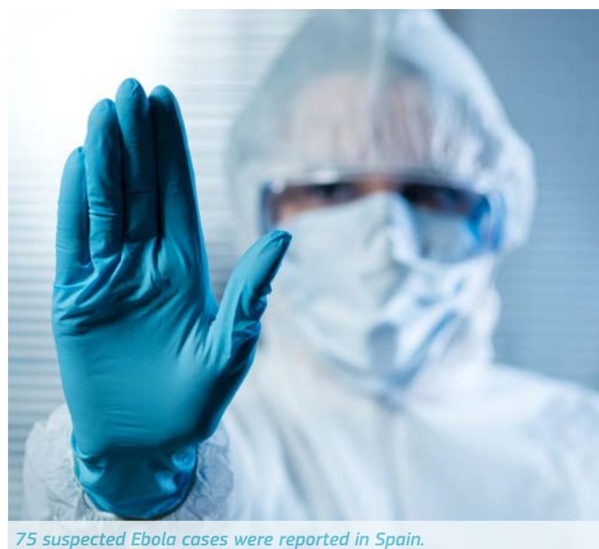
75 suspected Ebola cases were reported in Spain.

EU policy seeks to protect Europeans from serious health threats that have impacts across national borders. These challenges can be more effectively tackled by Europe-wide cooperation. Under Article 168 of the Lisbon Treaty and Decision 1082/2013/EU on serious cross-border health threats, the EU encourages coordination between countries, including the sharing of best practice.