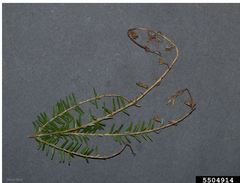
Figure 3: Eastern hemlock ( Tsuga canadensis ) infected by Melampsora farlowii

In North America, while the disease can be commonly found in natural forest stands, the attack is usually so light as to be inconspicuous (Hepting and Toole, 1939). However, hemlock twig rust can cause considerable damage in commercial tree nurseries, where cultural conditions favour the development of disease (Kenaley and Hudler, 2010). Plants a few years old are often rendered unsaleable following attack (EPPO, 1997; CABI, 2018). Repeated attacks dwarf trees and sometimes result in their death (Hepting and Toole, 1939).