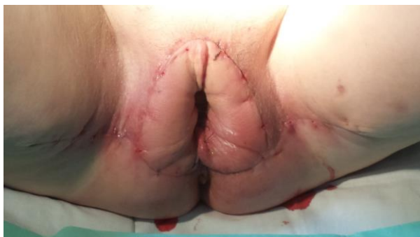
Figure 8. Results three weeks after the surgery

The patient presented no complications post-surgery and was discharged a week later in order to avoid unnecessary movements that might affect the healing process of the surgical wound. A follow-up session took place three weeks later for a post-operative examination and suture removal. The final pathologic analysis of the biopsy specimen revealed a multifocal vulvar Paget's disease, with surgical margins free of tumor as confirmed during the surgery. The patient returned after six weeks for a post-operative follow-up examination and is currently asymptomatic. The result is shown in Figure 8 .