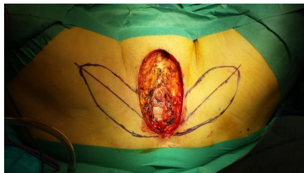
Figure 5. The designing of the suprafascial flap, in the form of a lotus petal