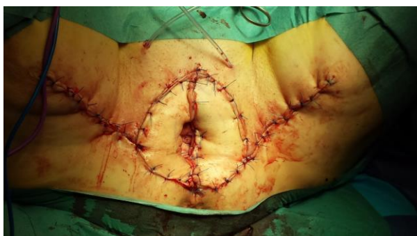
Figure 7. Skin closure performed in two layers