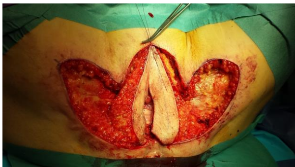
Figure 6. The flaps are fitted inside the defect