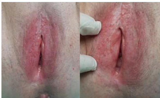
Figure 1. Preoperative image of the lesion

resulting in the diagnosis of extramammary Paget's disease (Figure 1). A subsequent immunohistochemical profile was performed, revealing a positive result for cytokeratin 7 (CK7) and carcinoembryonic antigen (CEA), while negative for S100. There were no pathological findings in either the abdominal and pelvic computed tomography (CT) scan or the mammography. The patient underwent a vulvectomy using the Mohs micrographic surgical technique, performed by an experienced gynecologic surgeon.