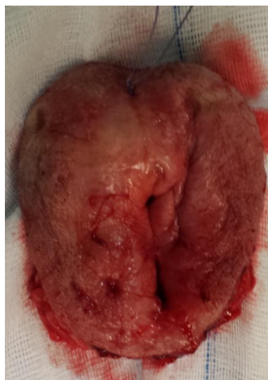
Figure 4. The biopsy specimen was sent intraoperatively to pathology for urgent analysis in order to determine whether or not the margins were affected

The area of the vulva to be excised was first delimited, taking into account surgical margins of 3 cm (Figure 2). The vulvectomy was then performed using a monopolar and bipolar electro-surgical device and the biopsy specimen was sent to pathology for an intraoperative study (Figures 3 and 4). It was concluded that there was an absence of tumor cells in the biopsy specimen. The surgeon then proceeded with designing the suprafascial flap (i.e., in the form of a "lotus petal") as shown in Figure 5 and carried out the vulvoperineal reconstruction. The gluteal-fold flaps were drawn and adapted to the size of the defect (Figure 5). The flap, including the deep fascia, was then raised towards the defect and inserted inside the latter (Figure 6). Finally, the skin closure was completed in two layers. The final result showed no open defects (Figure 7).