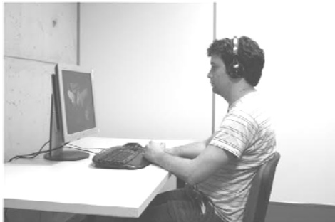
Self-administered computer-aided exposure (CAE-SA)