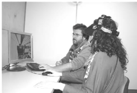
Virtual reality exposure treatment assisted by a therapist (VRET)