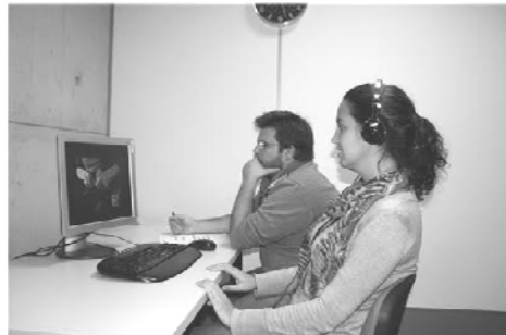
Computer-aided exposure with a therapist (CAE-T)