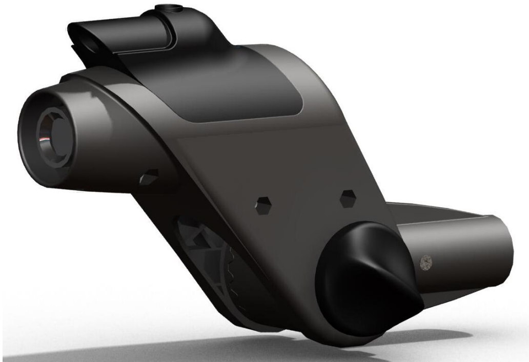
Figure 2. CAD model of underwater camera assembly

The next step is to carry out an LCA of each of the above materials (and their relevant manufacturing processes) in SimaPro and export the results to an Excel spreadsheet. Below is an example of the results of analyzing one kilogram of ABS with the Eco-Indicator 95 method.