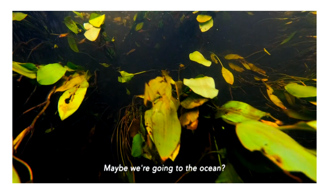
Figure. 2 Małni – Towards the Ocean, Towards the Shore (Hopinka, 2020)

"Where are we going now? Maybe we're going to the ocean? Maybe we're going upriver? Maybe we're going downriver? Maybe we're going towards the ocean?"