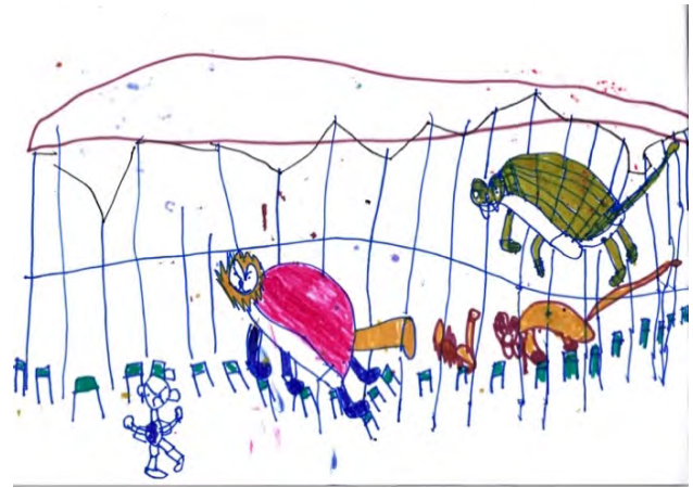
Figure 1. "Battle in colloseum"

When I see an autistic child painting, I like being invited into his world and enjoy the wildness of his imagination. Once when I saw a painting of a 10-year-old autistic child, he described an object identified as Gladiator, a moss-colored lion, a chicken, and a colossal stage as a place (Figure 1).