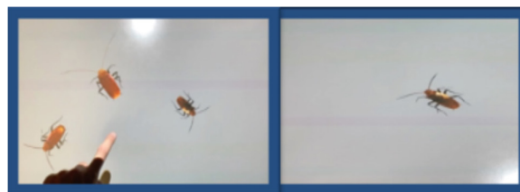
Figure 2 The image shows the MS condition on the left and the SS condition on the right. MS, multiple stimuli; SS, single stimulus.

In this study, both treatment conditions will be applied using the P-ARET system. However, in one condition