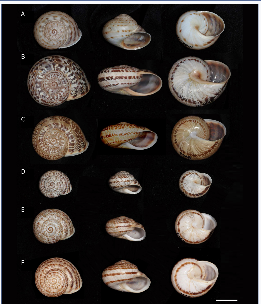
FIGURE 1. Shells of the various species of Allognathines endemic to the Balearic archipelago (catalog numbers from the author's Museological Collection). A: Allognathus graellsianus , Binifaldó (Escorca, Mallorca), 22.iv.2013, CRA-13883-1; B: Tramuntanicola culminalis (puig de Massanella, Escorca, Mallorca), 27.vi.1992, CRA-4339-1, holotype; C: I. (I.) balearicus , font des Polls (Valldemossa, Mallorca), 14.v.1998, CRA-8442, neotype; D: I. (I.) minoricensis , Trebalúger (es Castell, Menorca), 10.vii.1978, CRA-1159-1; E: Iberellus (I.) companyonii , es cap Blanc (Llucmajor, Mallorca), 5.viii.1993, CRA-4740-1; F: I. (Nesiberus) pythiusensis , es Pouàs (Sant Antoni de Portmany, Eivissa), 27.x.1994, CRA-5298-1. Scale bar = 10 mm.

Conquilles de les diverses espècies d'allognatinats endèmiques de l'arxipèlag Balear (números de catàleg de la col·lecció museològica de l'autor). A: Allognathus graellsianus , Binifaldó (Escorca, Mallorca), 22.iv.2013, CRA-13883-1; B: Tramuntanicola culminalis (puig de Massanella, Escorca, Mallorca), 27.vi.1992, CRA-4339-1, holotip; C: I. (I.) balearicus , font des Polls (Valldemossa, Mallorca), 14.v.1998, CRA-8442, neotip; D: I. (I.) minoricensis , Trebalúger (es Castell, Menorca), 10.vii.1978, CRA-1159-1; E: Iberellus (I.) companyonii , es cap Blanc (Llucmajor, Mallorca), 5.viii.1993, CRA-4740-1; F: I. (Nesiberus) pythiusensis , es Pouàs (Sant Antoni de Portmany, Eivissa), 27.x.1994, CRA-5298-1. Escala = 10 mm.