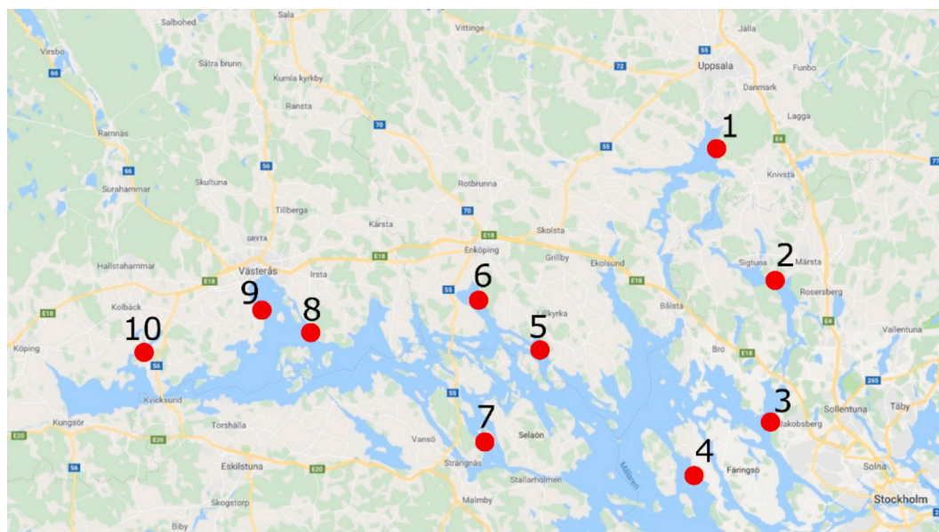
Fig. 1. Indicated sampling locations in Lake Mälaren, Sweden.

(18th September to 5th October 2018), and samples were deployed from shore at \sim 40 cm below the surface level and at \sim 10 m from the shoreline. Water temperature and pH were measured, and grab samples were collected for analysis of dissolved organic carbon (DOC) after placement (18th September 2018), during the deployment (26th September 2018) and at collection of the samples (5th Oct 2018, see Table S1 in Supporting Information A (SI_A)). After sample collection, the samples were stored cold during transport (max 1 h) and then at -20 °C until sample preparation.