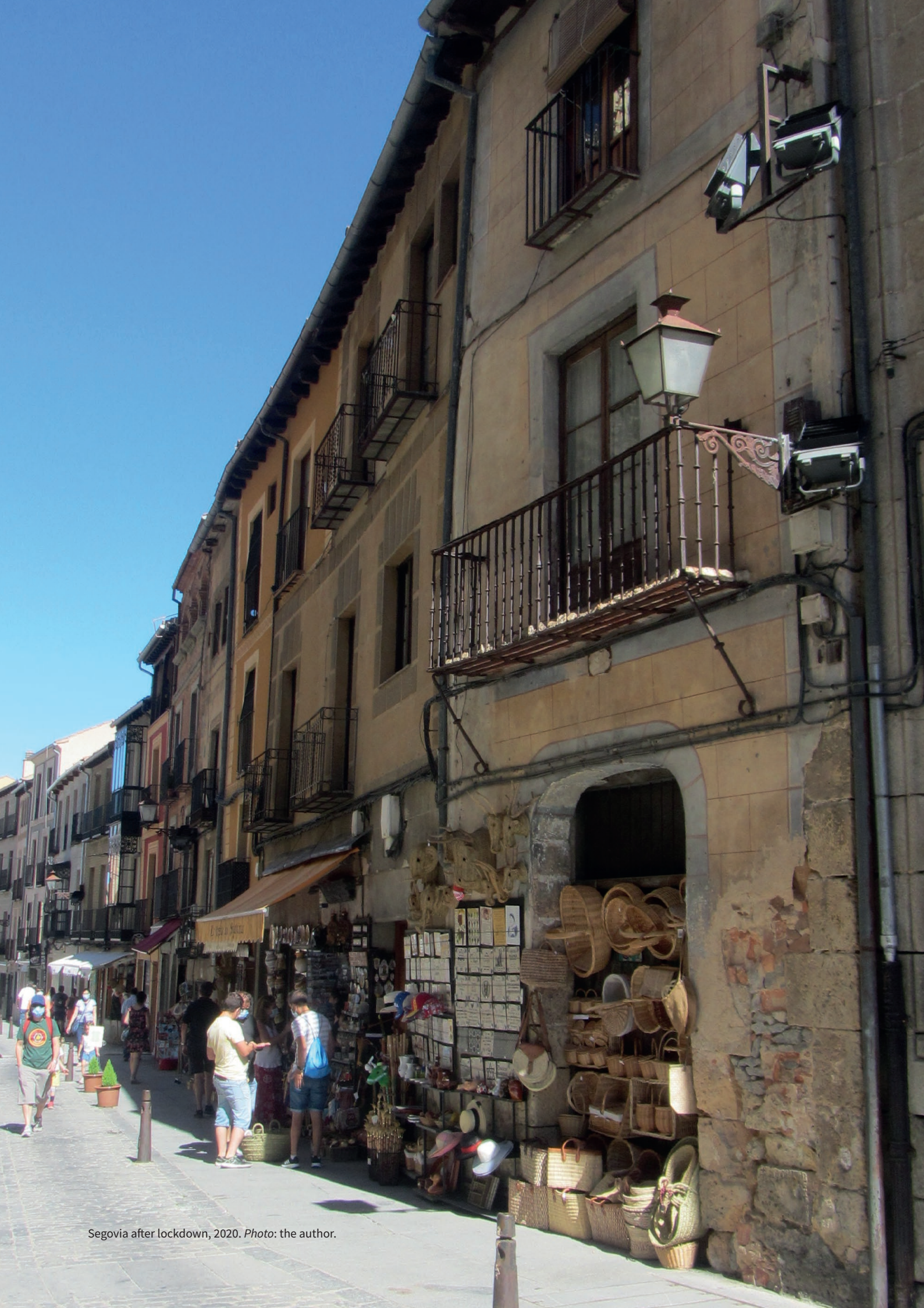
Segovia after lockdown, 2020.