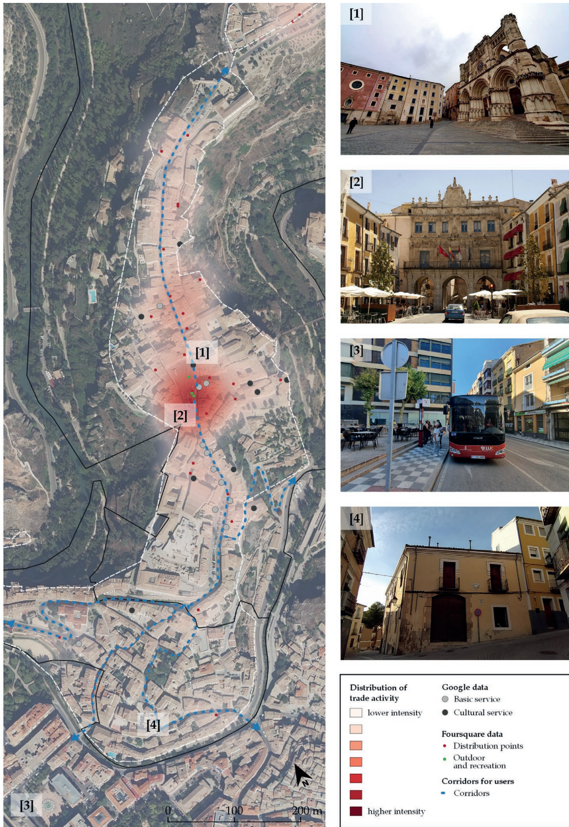
Figure 2 | Services, infrastructures, places, activities and events in Cuenca's WH area. Source: Pablo Altaba and Juan A. García Esparza.