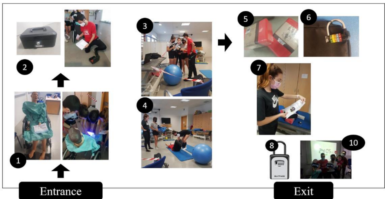
Figure 2. Escape room with physiotherapy students.

In the evaluation through the Escape Room, each student had to solve a clinical case individually and the help of all the members of the group was required to open the locks and boxes that led from one case to another in order to escape from the room. Each group consisted of 4 people, and they had 30 min to escape. The four clinical cases were solved with the contents taught in the practical classes of the subject. The items that made up the individual evaluation of each student included the position of the patient, the position of the Physiotherapist students, the indications and corrections that the Physiotherapist students gave the patient and the procedures proposed based on the contents of the subject, with a score range of 0 to 10. In the first case, for example, students were required to perform the procedure to release the diaphragm in order to collect the materials required to unlock the first padlock and gain access to the following case (Figure 2).