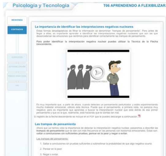
Fig. 2. “Screenshot” of one of the modules of the Internet-based treatment for emotional disorders