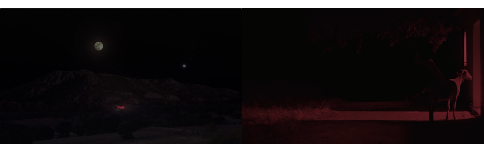
Images 6 and 7. Two moons shine at night in Mighty Flash (Destello bravio, Ainhoa Rodríguez, 2021)

has been especially tumultuous for Spanish society. While Mercedes Álvarez introduced these three dimensions in The Sky Turns (El cielo gira, 2004), and again with Mercado de futuros [Futures Market] (2011), giving a voice to the village of Aldealseñor in the first and offering a devastating portrait of the dialectic between speculative discourses and the plight of the underprivileged in the second, the new generation of female filmmakers have continued to explore them. For example, in The Silence that Remains (El silencio que queda, 2019), the first documentary by the artist Amparo Garrido, the filmmaker draws on a personal experience to tell the story of a blind person's relationship with birds, depicting her own relationship with animals in the process. Dreaming and grieving over the landscape are present in Maddi Barber's gaze in Above 592 Metres (592 metroz goiti, 2018) and Urpean Lurra (2019), while a profound connection with rural traditions is evident in Elena López Riera's Los que desean [Those Who Desire (2018), and Diana Toucedo explores the magic and mystery of a village near Lugo in Thirty Souls (Trinta Lumes, 2017). The subjective gaze, privileging the diary form, based on found material, is constructed in discourses of the unspeakable, about suicide in films like Ainhoa: yo no soy esa [Ainhoa: That's Not Me] (Carolina Astudillo,2 2018), or desire in My Mexican Bretzel (Núria