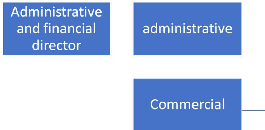
Figure 3. Albacete organic saffron chart