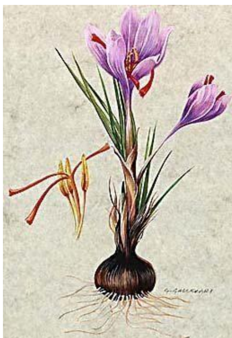
Figure 1. Saffron plant

The leaves are directly born from the bulb, making a stem of leaves like green beans grouped in bunches between 6 to 10 leaves each bunch, being taller than the flowers. These flowers are known as “La Flor Rosa del Azafrán”, which is violet blue. It can be found between the bulb and the leaves, it has a flared form, 6 petals and more than one stem. Escribano y Escribano (2000) define the flower of saffron. It is divided in verticilo and it has yellow antennas. The plant has an ovary, which has three orange or reddish-yellow stigmas, which are thin and thicker at the tips; this is what we call saffron.