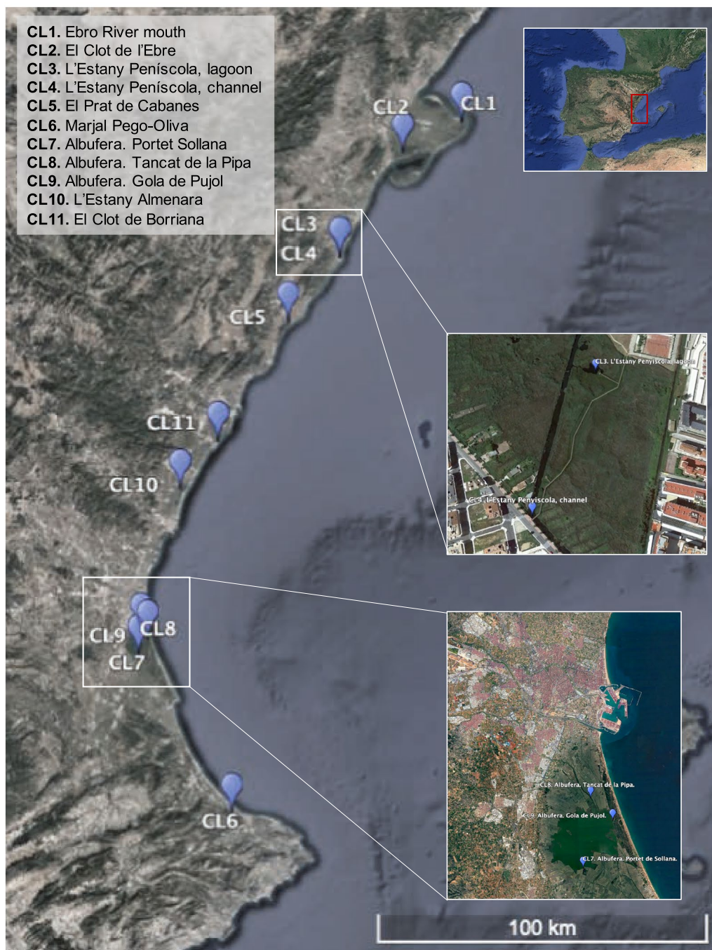
Fig. 1 Sampling points across Spanish Mediterranean coastline. Magnified areas show locations where sampling points were nearby. Upper-right map indicates the region within the Iberian peninsula under study (red square)

CL4 and CL9 were collected in points where human activity can be of importance (CL3 and CL4 close to urbanized areas, and CL9 within a highly touristic part of 'Albufera' natural park). Finally, sampling points for CL1 and CL8 might be affected by treated wastewater streams and urban runaways from large cities, although