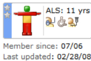
Figure 1. Individual summary information (the “nugget”)