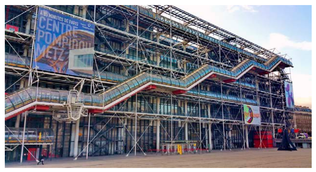
Centre Georges Pompidou.