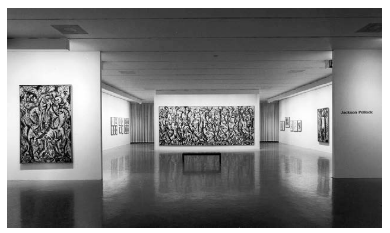
White cube installation methodology in the exhibition Jackson Pollock, April 5–June 4, 1967.

asserted that there was, «No negative effect -development was based on creating enhanced spaces appropriate to a range of contemporary art forms and materials- architecture [was] based on [the] principle of enhancing [the] presentation of and access to art, not to draw attention to [the] architecture itself». Although this respondent claimed that the architecture had no negative impact upon the display of their collection, based on the feedback, it appears that the architectural program was designed with the collection already in mind. This design strategy, then, must have been implemented at the planning's outset. In some instances, art informed the architecture, as one respondent noted, «The museum architecture was partly shaped by contemporary art [...] the exhibition spaces from floor 2 to 8 are black boxes, which combine different types of objects and to create transcultural and transhistorical presentations. In our exhibitions we collaborate with contemporary artists which have meaningful work in relation