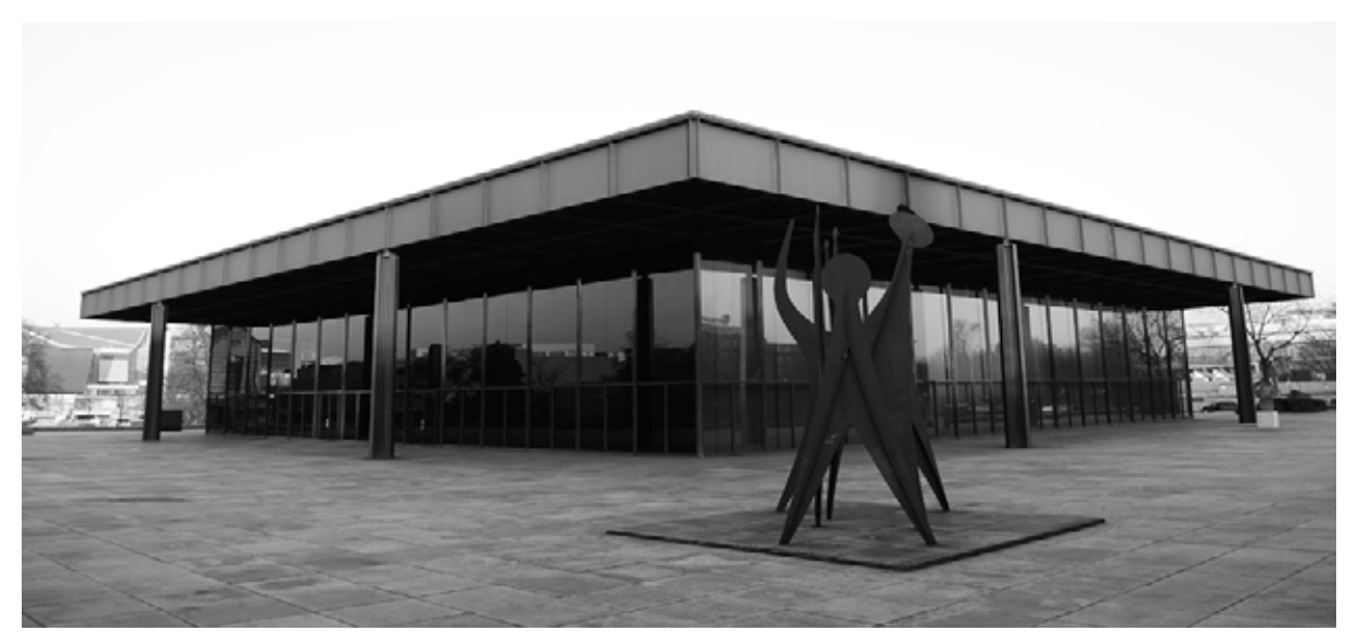
Neue Nationalgalerie by Ludwig Mies van der Rohe.

Greenberg, «if interiors were remodeled, the exteriors remained the same» (Greenberg, 1996). Neoclassical facades of many of these institutions sharply contrasted with the chaotic interiors of their galleries, which exemplified disunity between exterior and interior architecture. This dual identity of European institutions in which modern art was displayed during this period prompted some curators to reexamine the types of spaces best suited for the display of new art forms. In the following decades, museums galleries became more homogenized, perhaps due to a more globalized art market.