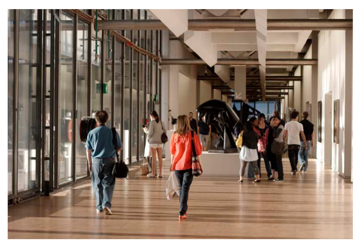
Centre Georges Pompidou from inside.

contemporary art galleries in New York, then the epicenter for the production, exhibition, and consumption of modern art, set up shop in downtown commercial spaces, European museums were retrofitted to suit modern art. These refurbishings extended beyond the application of a fresh coat of stark-white paint to gallery walls; it entailed stripping and polishing the (typically wooden) floors, installing bright overhead lighting, and discarding all seating so that viewers could better absorb the enormity of much of the work on view. This unobstructed closelooking encouraged by these spaces removed any sense of site-specificity or recognition of the passage of time, as homogeneous galleries blended into one another without much distinction. The only discernible realization of site-specificity occurred only after exiting the galleries, as noted by theorist Reesa