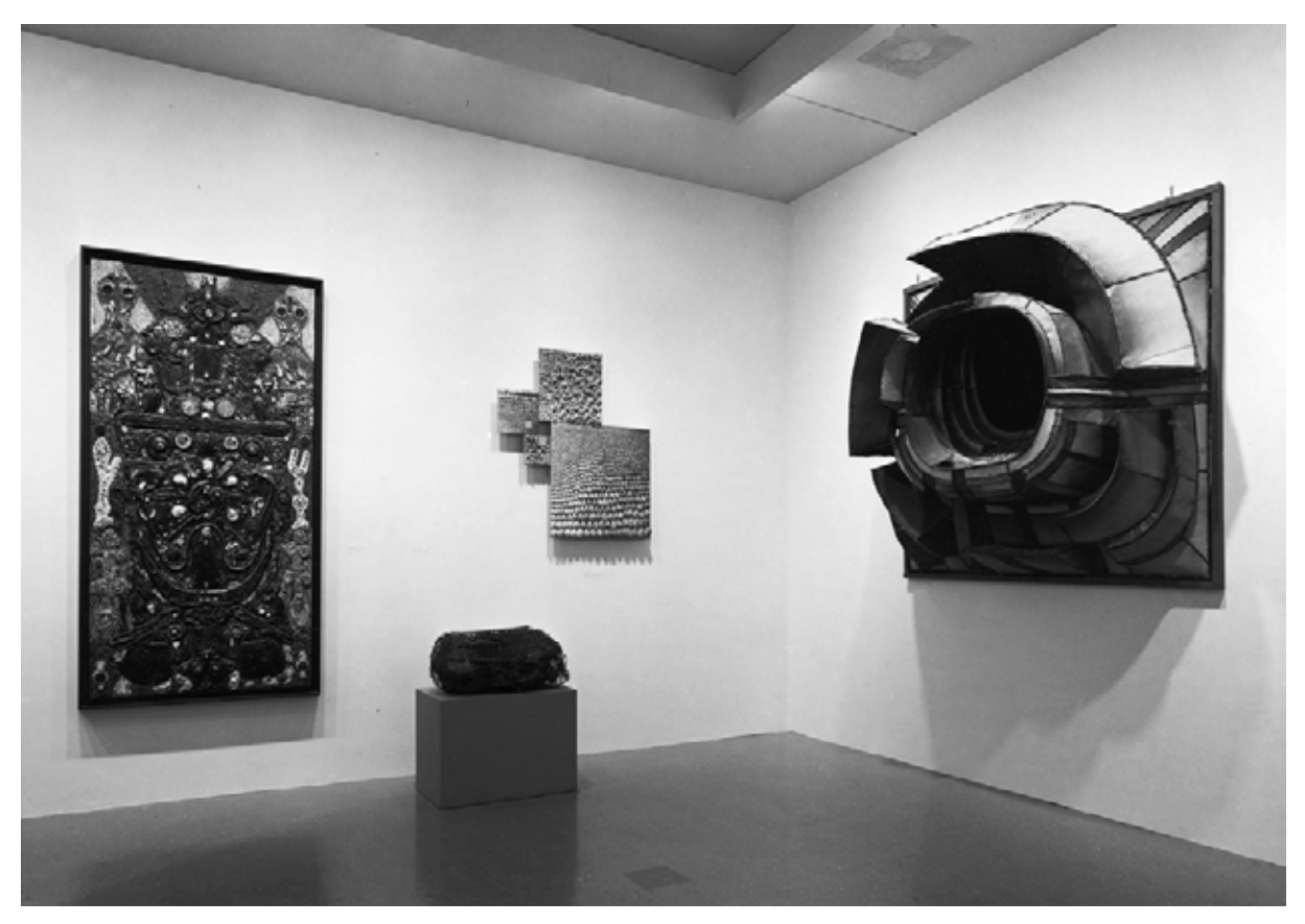
Installation view of the exhibition, The 1960's: Painting and Sculpture from the MoMA Collection. June 28, 1967–September 24, 1967. Photographic Archive. The Museum of Modern Art Archives, New York. IN834.5. Photograph by James Mathews

offer the types of spaces required of a museum in the twenty-first century. It seems that the band-aid approach of either reskinning the exterior to buildings at the cost of the interiors or building anew prevailed.