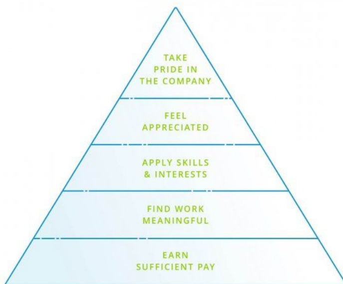
Figure 5: Pyramid of worker needs

Employees, once they consider that they earn enough for their work, seek to find meaningful work in which their knowledge and experiences fit into their personal lives. They then look for a job where they can apply and broaden their skills and interests.