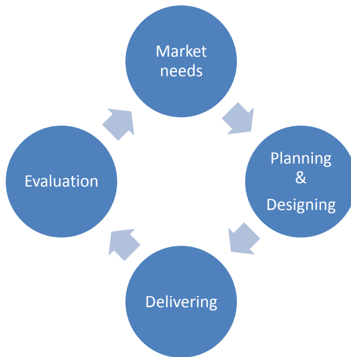
Figure 1: Conceptual Framework: Developing a WBL Programme

However, as this paper concerns WBL we will highlight understanding of the market needs separately from the planning stage, as this need should be the essential driver behind a WBL programme (Fig. 1).