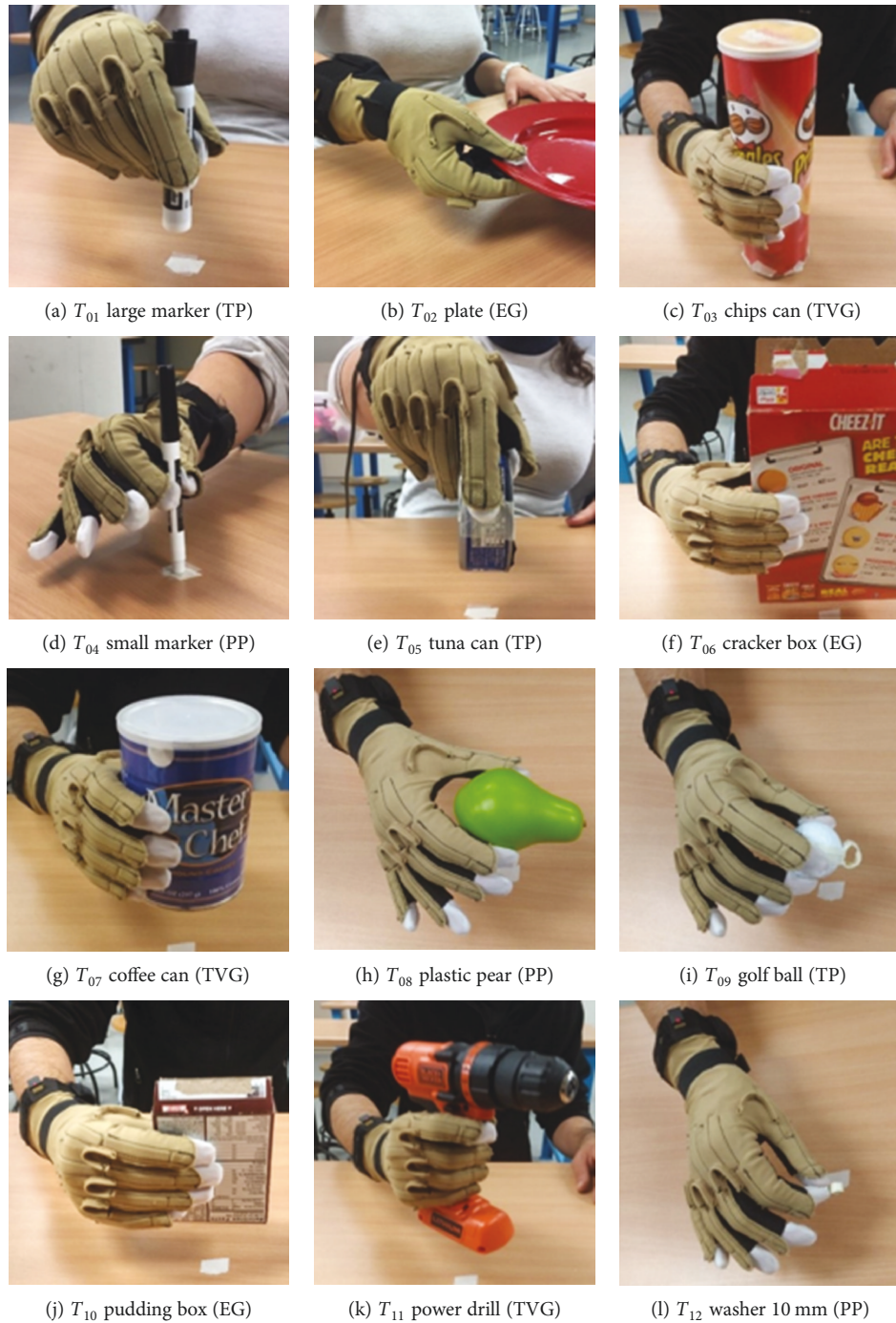
FIGURE 2: Grasping tasks of the experiment (a-l). T_g are the tasks ordered ( g : indicates the order) followed by the object of the Yale-CMU-Berkeley Object and Model Set [14] to grasp and in brackets the grasp type to be performed in each task (TP: tripod pinch, EG: extension grip, TVG: transverse volar grip, and PP: pulp pinch).

specified order. The experiment was repeated three times per subject.