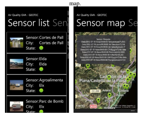
For a first prototype, an application for the Windows Phone OS has been created. Figure 2(a) shows a screen shoots of the mobile application where the list of all sensors and users can

Figure 2: (a) List of air quality stations. (b) last observation in