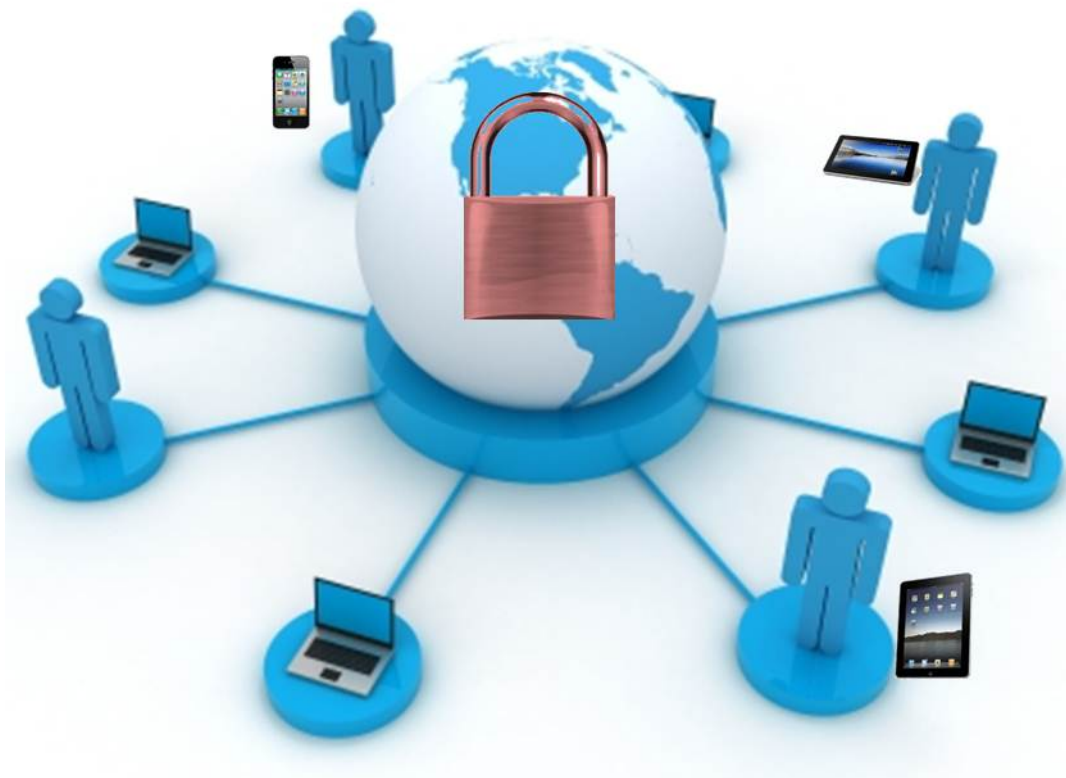
Picture 6: Technological factors

In addition to this, it is also going to make use of social networks, the one that the municipality has, like Facebook or Twitter. Also a YouTube channel with videos and pictures of Sagunto.