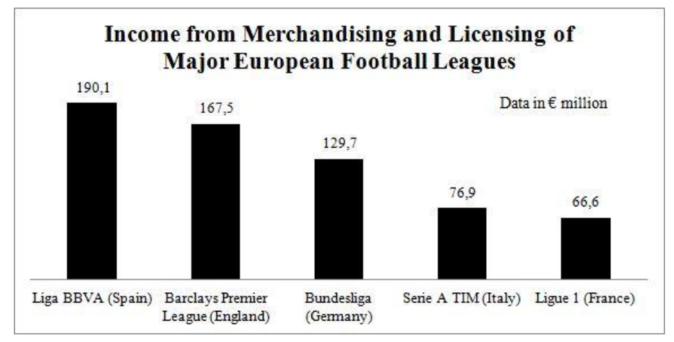
Graph: Income from merchandising and licensing of major European football leagues. Adapted from Sport+Markt (2010).

As a consequence, major clubs must be understood nowadays as complex and peculiar businesses that are capable, like any other corporations, to make profits and pay dividends, but they can also go bankrupt (Szymanski & Kuypers, 1999: 1).