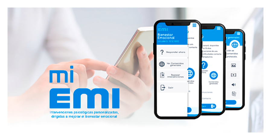
Fig. 2. My EMI, Emotional Well-being app.