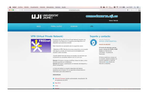
UJI page to download the VPN software.