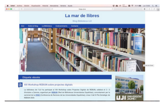
Link to the e-books available for the UJI community.