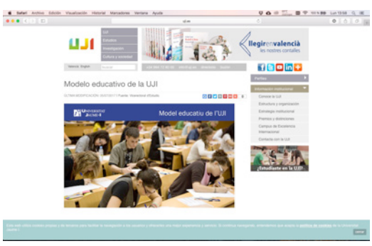
Educational model of the UJI.