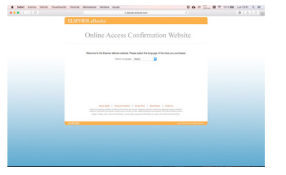
Link to Elsevier e-books, with free access until January 2018.