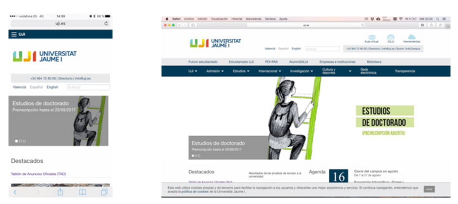
Figure 1. UJI main website, in versions for smartphone and PC.

A demonstration was made of the contents of the UJI website, which appears in Figure 1 and how to make use of the Virtual Classroom-SIA. Several pages of the UJI were presented, especially those of the library (Figure 2).