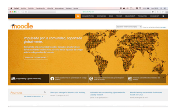
Moodle home page.