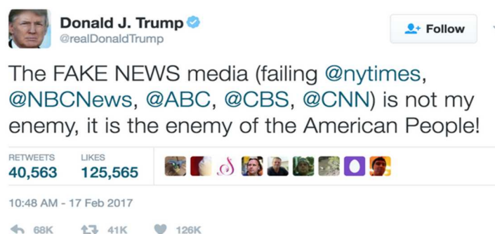
Figure 6: Example of digital interaction between @realDonaldTrump and different media that generated 68K replies (17 February 2017).

- Dialogue. Finally, as the most dynamic interaction mechanism on Twitter, we find the digital dialogue between different users, which is represented by the exchange of at least two tweets with mentions between media / journalists and political actors. Although empirical studies to date show a very limited development of these types of interactions (Noguera-Vivo, 2013; Lee et al. 2016), when they occur they are very significant. If the actors are relevant and the digital dialogue has a certain controversy, there is a high probability that it will become mainstream news. In this interaction, the key factors to analyse are the initiative in the process and the communicative domain in the development of the dialogue. Of course, the use of the other interaction mechanisms (#, @, RT), which make this interaction even more dynamic, can be included in this dialogue.