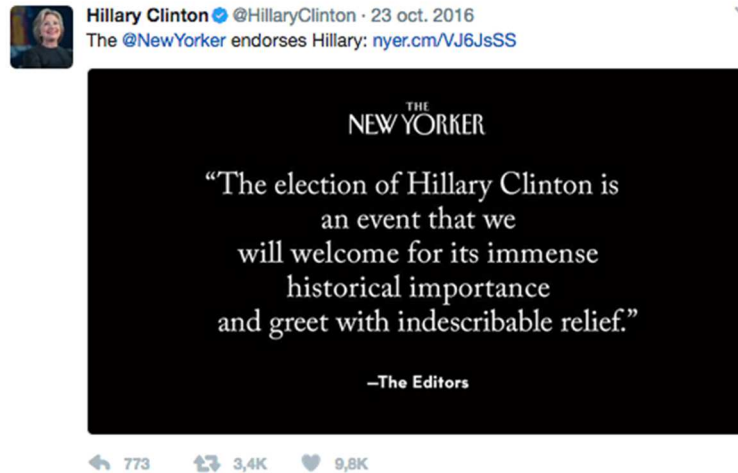
Figure 2: Example of link use from @HillaryClinton (23 October 2016).

- “Like” (♥). This mechanism makes it possible to positively assess the content of a tweet in a very direct way by merely a click (appreciation, interest, etc.). A small heart represents it, and similarly, it is possible to undo it instantaneously. Different to the hashtag and the link, which can only provide or disseminate information, the “like” has an affective connotation that represents an active journalistic voice –close to the interventionist role– (Mellado & Vos, 2017) in professional practice. Indeed, with this action the journalist gives a sort of endorsement to the political source that gets the “like.” In terms of visibility within the network, its value is still limited but it can help interaction when making preliminary contacts with political sources, showing an interest that can later lead to a stronger interaction or a more complete dialogue on Twitter.