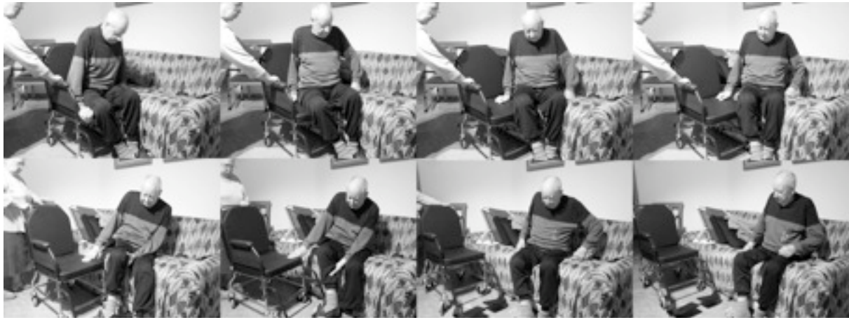
Figure 3. Sequence of moving the user to the couch with the assistance of an indirect user to immobilize the wheelchair

The principal user is an elderly person, 80 years of age, afflicted with arthritis, especially intense in the knees, who has a significant medical history [figure 3]. The user is not able to walk normally because of the arthritis, thus he needs assistive devices in order to recover his mobility and independence. He is 180 cm tall and weighs 81 kg. The user is not strong enough to propel the chair on his own. The tasks to be conducted on the wheelchair are varied; among the most critical ones are the transfer to the bed and water closet, which he needs assistance with. Other users of the wheelchair are the persons assisting the main user: his wife, family and, at times, a physical therapist or other clinical assistants, such as ambulance drivers, nurses, etc. These users are named secondary users, although their relation with the product is essential [Hoffman 2005].