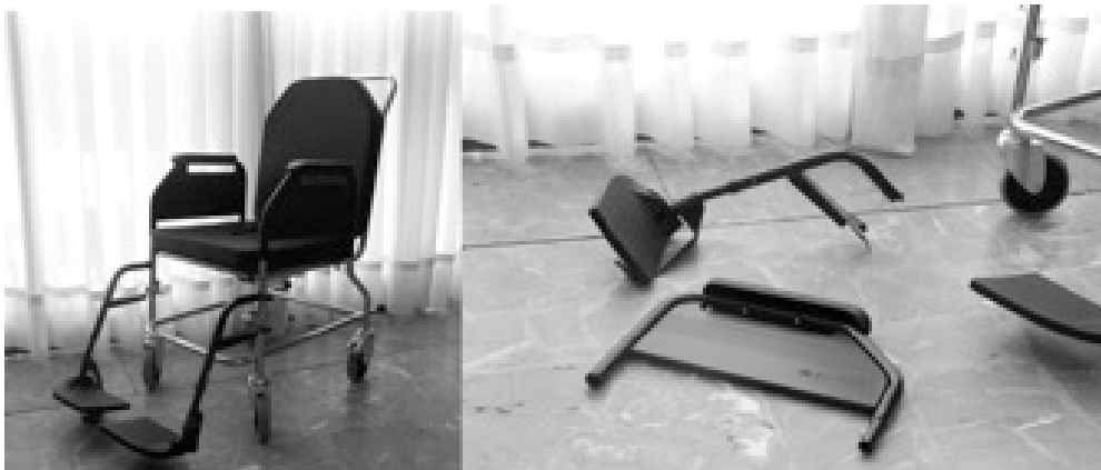
Figure 2. Wheelchair with armrest and footplates

The wheelchair is broken down into the following critical elements: a steel structure composed of a padded seat and detachable back, and system of movement and propulsion for the assistant; brake system integrated in the back wheels; removable armrest system and removable footplate system.