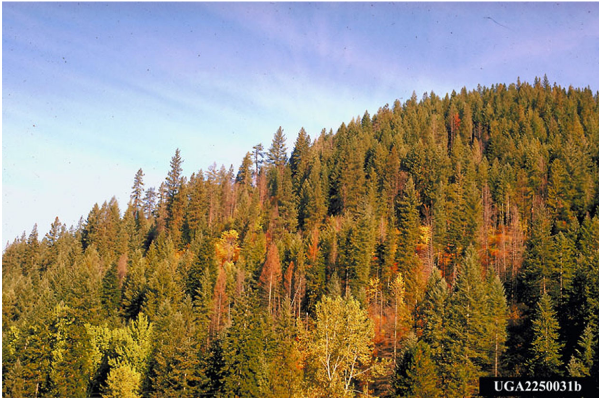
Figure 4: Mortality centre due to Coniferiporia sulphurascens/weirii in the USA

The fungus causes reduction in tree growth due to reduced nutrient and water uptake, and because of the allocation of resources to defence rather than to growth (Lewis, 2013). Thies (1983) estimated growth rates in trees killed by C. sulphurascens as 32% less than those of healthy counterparts in their last 10 years of growth. Goheen and Hansen (1993) estimated a combined growth reduction and mortality loss of 40–70% in infested areas (reviewed by Lewis, 2013).