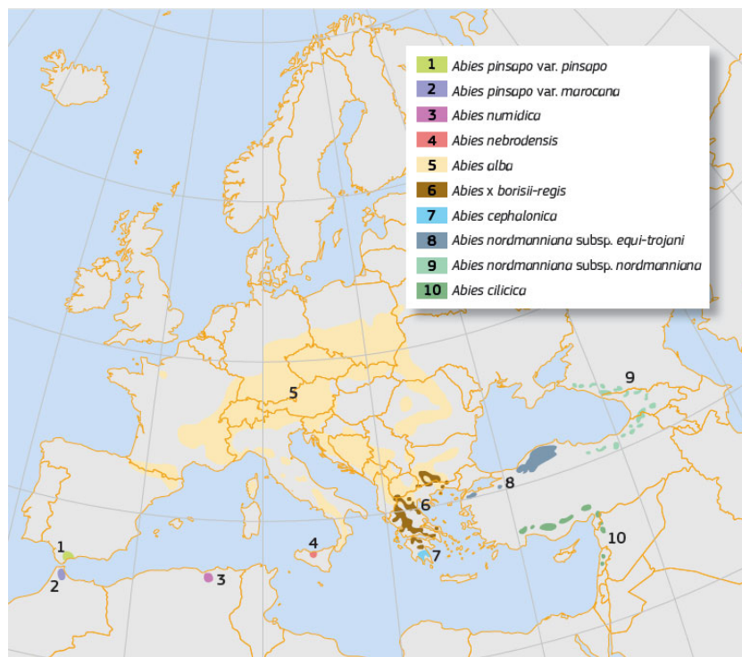
Figure 3: Plot distribution and simplified chorology map for Abies spp. Chorology of the native spatial range for the Circum-Mediterranean firs (Caudullo and Tinner, 2016)