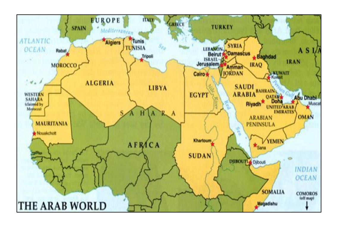
Figure 1- Map of the Arab World