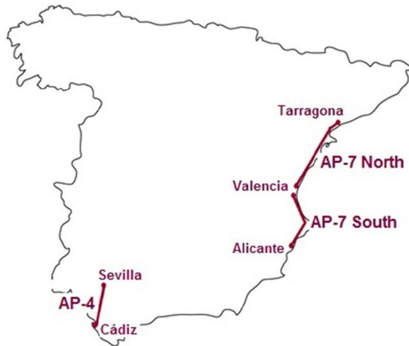
Fig. 3. View of the roads under study.