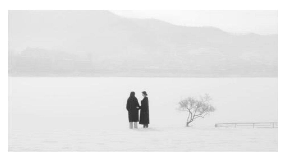
Figure 1. Hong Sang-soo illustrates the landscape of the memory on the riverbank of Hotel by the River, (Sang-soo, 2018)