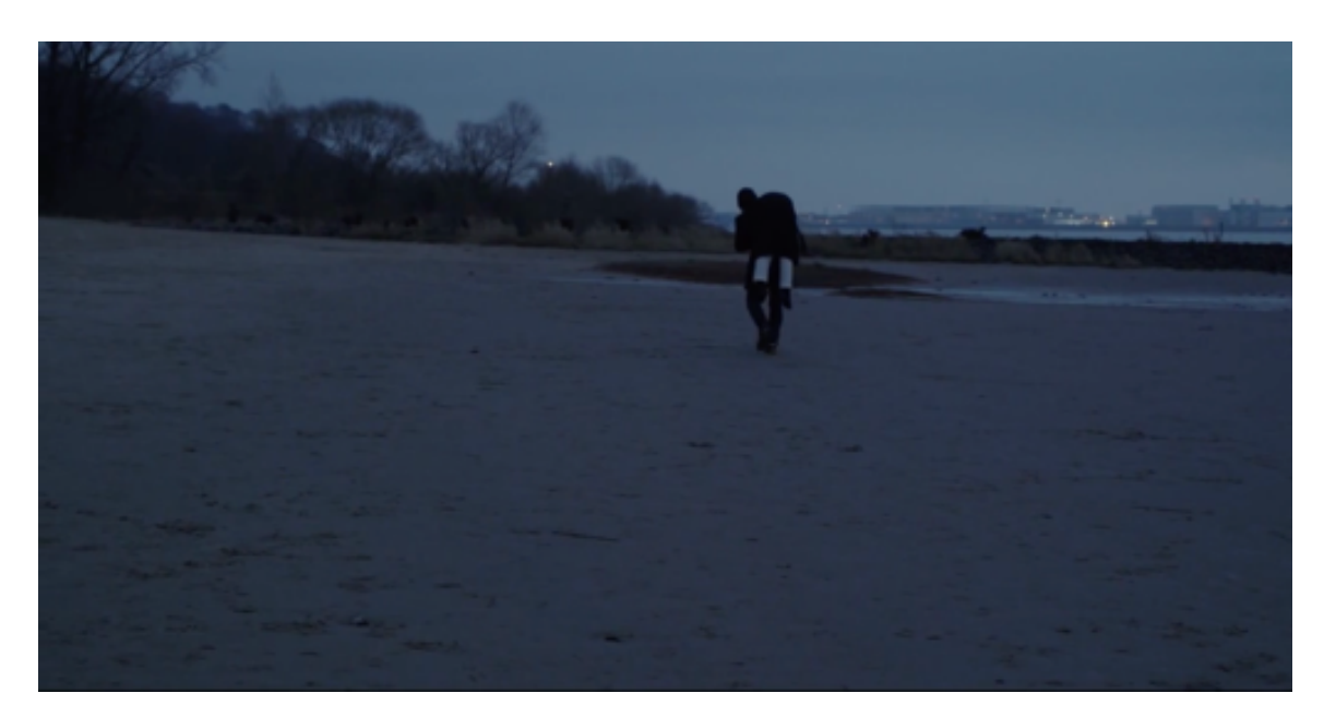
Figure 4. The fall of Young-Hee facing the impossibility of her desire