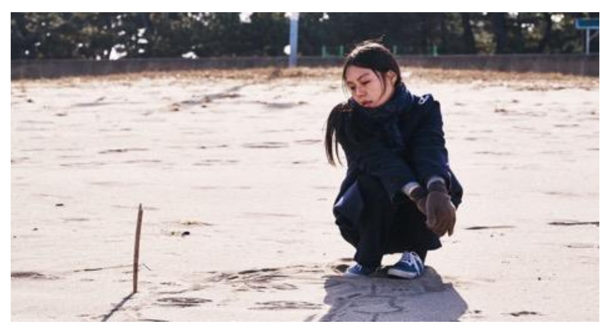
Figure 2. Young-Hee formulates the desire to reunite with her beloved in On the Beach at Night Alone (Sang-soo, 2019)

The space between the real and the oneiric can only be crossed by the Unkwown Man as a stranger (figure 3). The exchange of glances with the stranger, who seems to be able to transgress the limits of the frame and the limits of time, reveals the intricacies of Young-hee's memory. It is here that we are given a clue about the protagonist, who, as she wanders, crosses the threshold into the unknown: whoever crosses this threshold undergoes a transformation<sup>25</sup>. In crossing the threshold, Young-hee experiences the pain resulting from the denial of her loss. It is on the threshold between these two spaces that the fantasy of the arrival of the Other is sustained<sup>26</sup>. Her