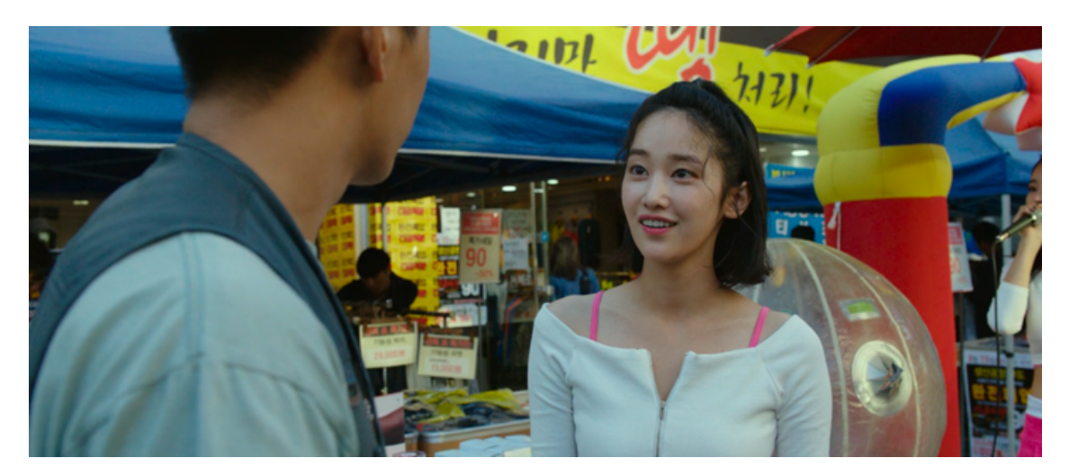
Figure 10. The first encounter between Jong-su with Hae-mi

She gives him his prize in the raffle—a pink watch—while they stand under a sign bearing the slogan "Time for everyone" (figure 10). He then gives it back to her as a gift, and from this moment Hae-mi will carry it with her. The motif of the watch will mark every event in her story, punctuating the timeline of her appearance, absence, and disappearance. In this way, it stands as a metaphor for the time limit set on Hae-mi's life. She has never had a watch before, has never been given time, but now that she has one it only serves to count out the time she has left until the execution of her death sentence.