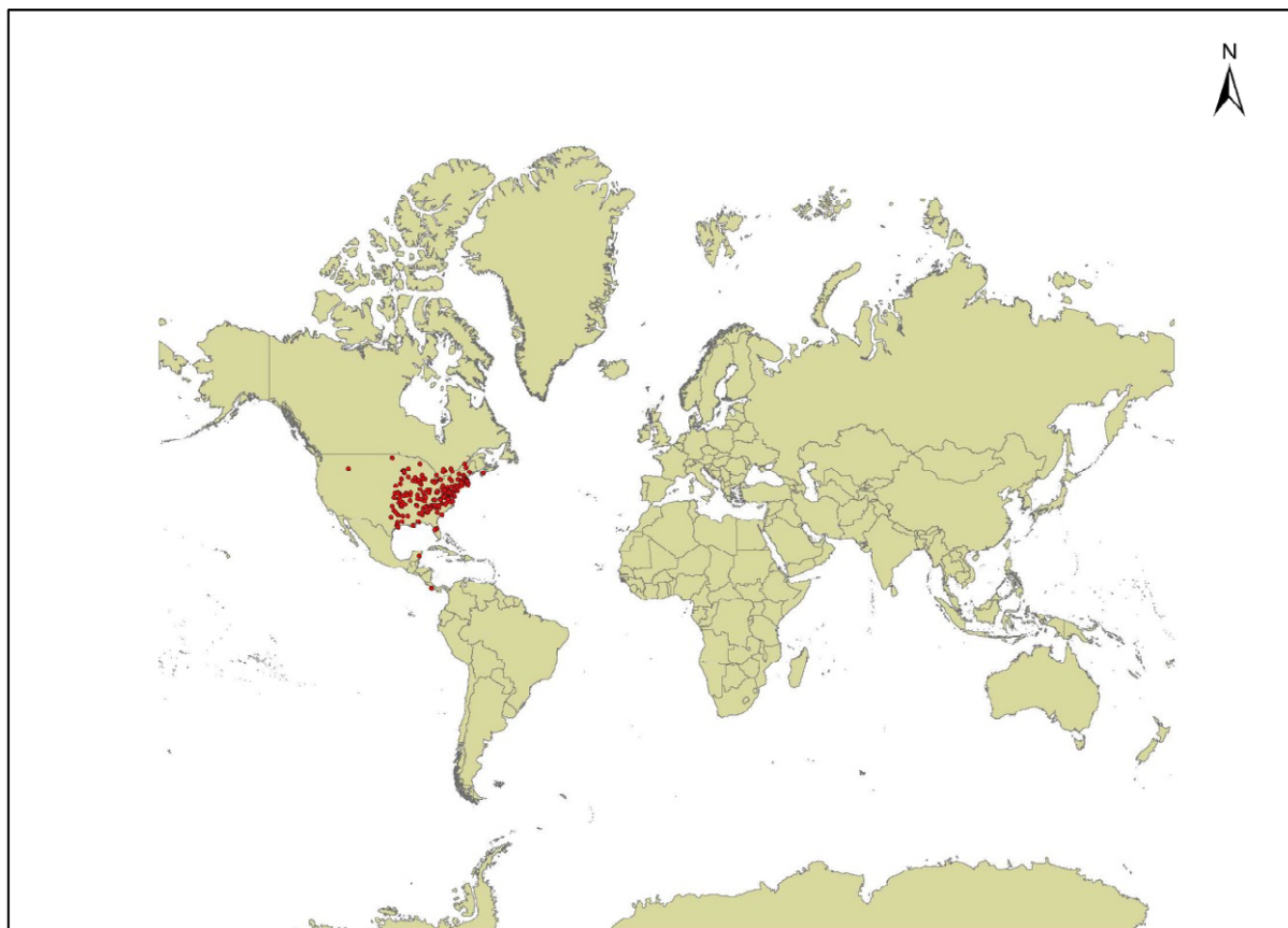
Figure 1: Distribution of Arrhenodes minutus based on GBIF (Global Biodiversity Information Facility) data (GBIF, online; accessed on 6 December 2018)