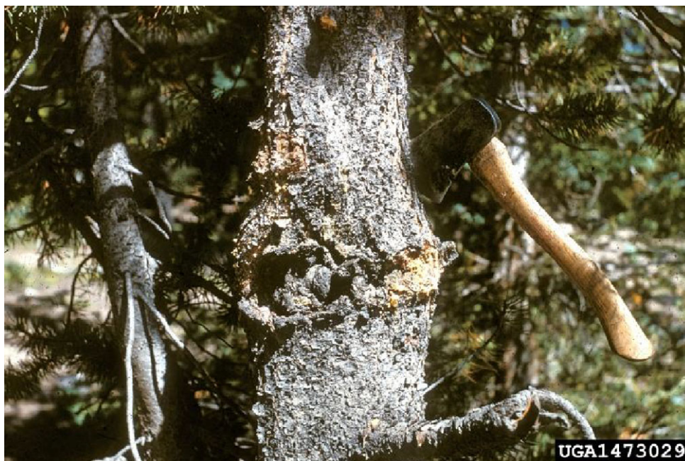
Figure 3: Stem canker caused by Cronartium harknessii on lodgepole pine ( Pinus contorta ). Photo by Rocky Mountain Research Station, USDA, Forest Service, Bugwood.org. Available online: https://www.forestryimages.org/browse/detail.cfm?imgnum=1473029